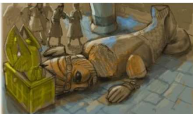
The loss and return of the Ark of the Covenant 4:2-7:2